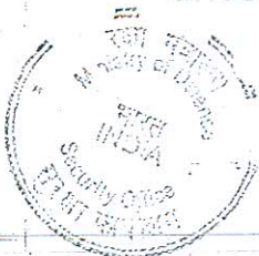
(Amitabh Kr Srivastav) Dy Dir (Security)